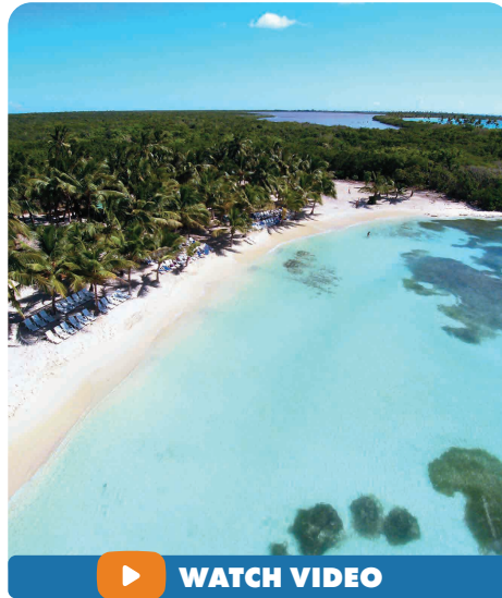
▶ WATCH VIDEO