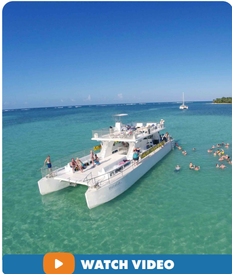
▶ WATCH VIDEO