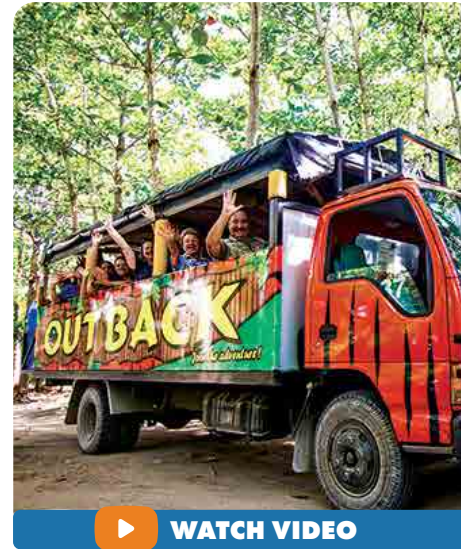
▶ WATCH VIDEO