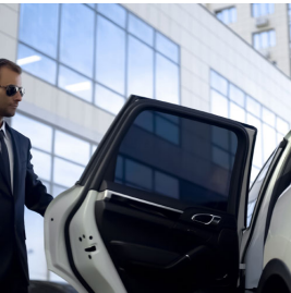
Private Transfer Venice Airport to Venice hotel

Arrive at Venice Airport. After clearing customs, meet your driver for a private transfer to your centrally located hotel. The remainder of the day is at your leisure. Explore your surroundings or just relax, and dinner will be on your own this evening.