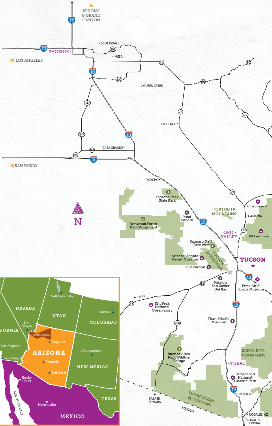
*Maps not to scale